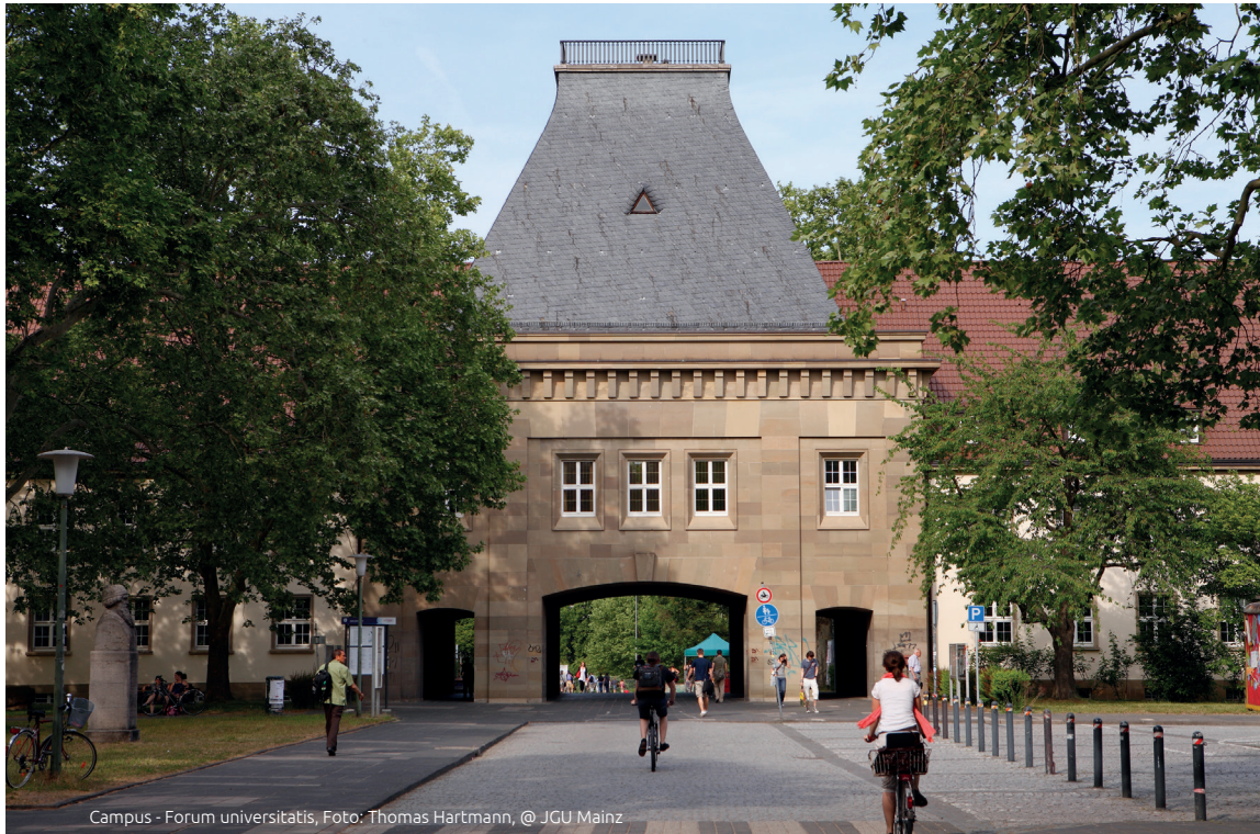
Campus - Forum universitatis