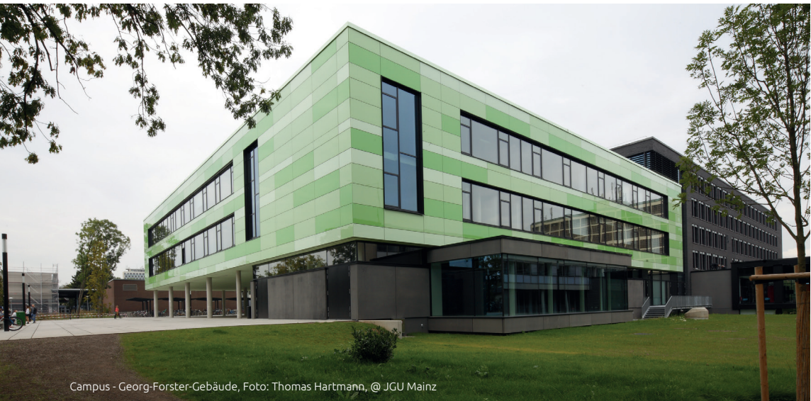
Campus - Georg-Forster-Gebäude

We are all familiar with the backward-looking aspects of responsibility, such as guilt, apology, blame, restitution and punishment. Philosophers have often feared that some or all of these aspects might prove unjustifiable insofar as a person 'could not have done otherwise.' I will propose that we can make good sense of the backward-looking aspects of responsibility if we focus on a less ,troubling claim: the person should have done otherwise. Whether or not the person 'could have done otherwise,' it is certainly true that no one can change the past. What we can do, however, is take responsibility for the 'should' that the person failed to act on. I will give an outline account of the backward-looking aspects of responsibility as practices by which we take responsibility for our moral agency and the morality we hope to share with one another.