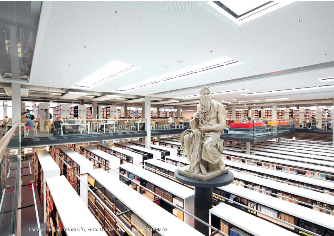
Campus - Bibliothek im Cfg

We are a group of students of Johannes Gutenberg University Mainz (JGU) who organizes the first ever international students' conference in Mainz. From this year on the conference will be held every year at JGU. The conference is open to all university students worldwide. It's our pleasure to invite you to participate in this event. The conference language is English.